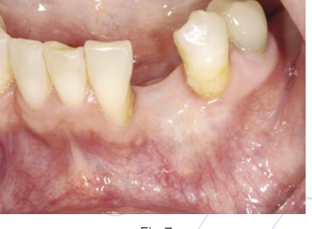
Fig 6 Fig 7

A high-density, titanium-reinforced PTFE membrane in a single-tooth configuration (Cytoplast® Ti-250 Anterior Narrow) was trimmed to fit over the defect and then curved over an instrument handle to provide three-dimensional support and stability (Fig 3a and Fig 3b).